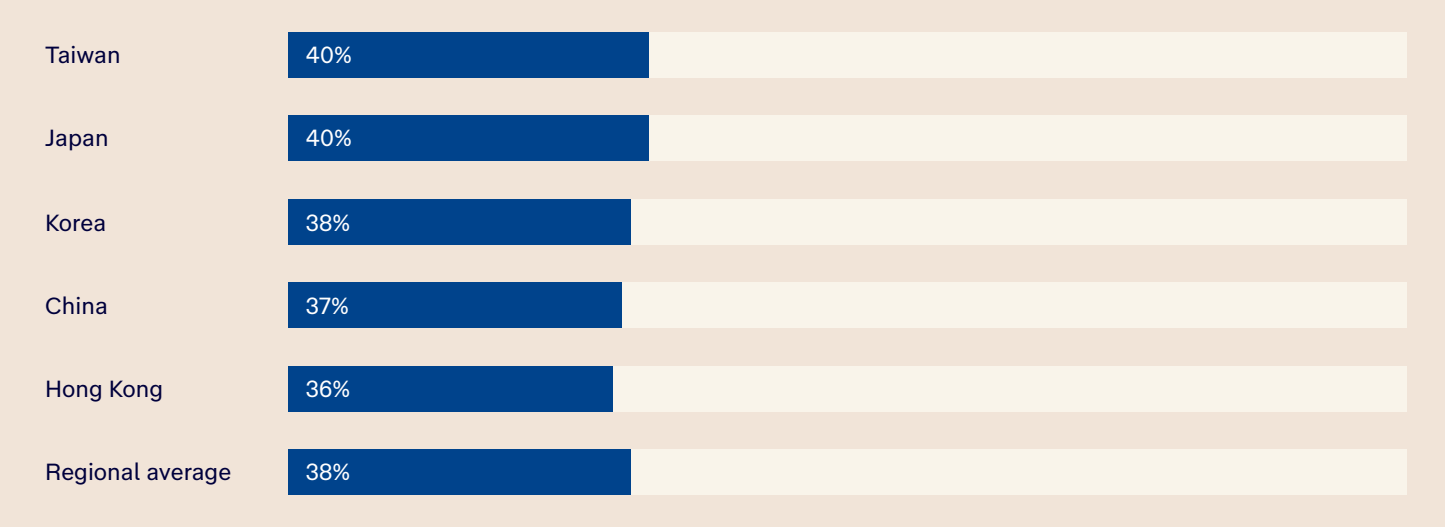
Figure 1: Percentage of IT/OT integration by market

Most Taiwanese firms (55%) plan to have IT and OT well integrated in the next 12 to 18 months, although only 36% see it as important for business outcomes (the lowest in North Asia), compared to a cross-region average of 48%.